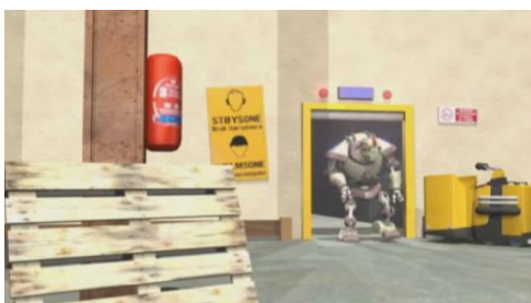
Robot (jan. 2007) personal work.

Animation, wrote the story, lighting, rendering with Maya mental ray.