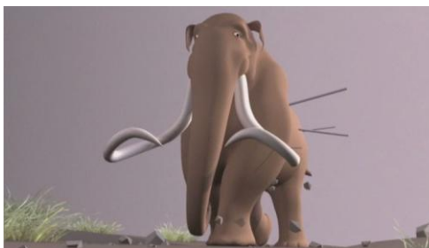
Mammoth (dec. 2008) personal work.

Animation, co-wrote the story, story board, layout, design, matte-painting, face and hair texturing, facial rig of the little girl.